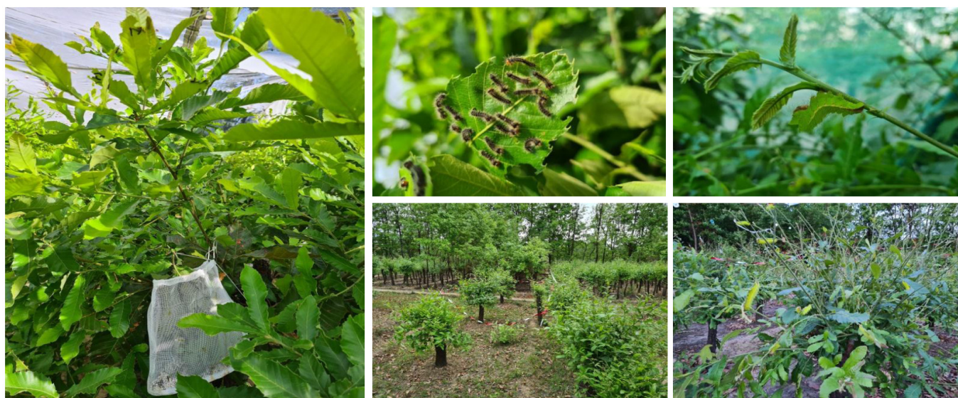
Fig 1: Outdoor rearing of Antheraea proylei during the year 2021-22 at REC, Palampur farm